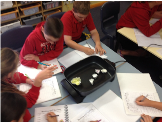
Experimenting with heating different substances including flour, wax, copha, sugar, salt and egg white!

We have had a very busy week in 4/5/6 and have enjoyed getting stuck into this Term's units of work. Our Science unit "Eating Out" has been great fun as we explore and observe what happens when different foods and substances are heated and cooled. On Tuesday this week we discovered why popcorn pops and enjoyed seeing this happen in slow motion via YouTube....and the taste-testing at the end was pretty good too!