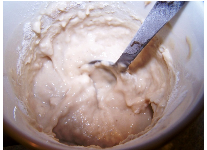
This is what our yeast plus sugar plus WARM water looked like!

Science was again lots of fun this week as we experimented with yeast! By combining the dried yeast and sugar with water at different temperatures we were able to see which reaction caused the most bubbles – with the warm water being the best! On Tuesday afternoon we experimented with pancake mixtures. Half the class made pancakes with baking powder, while the other half made it without. We rated our pancakes according to taste, texture, appearance and smell.....no surprises to find the pancakes WITH baking powder were by far the best!