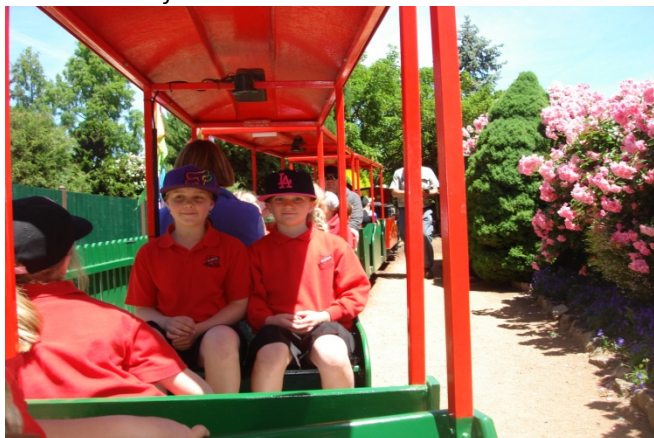
The train ride at Cockington Green.