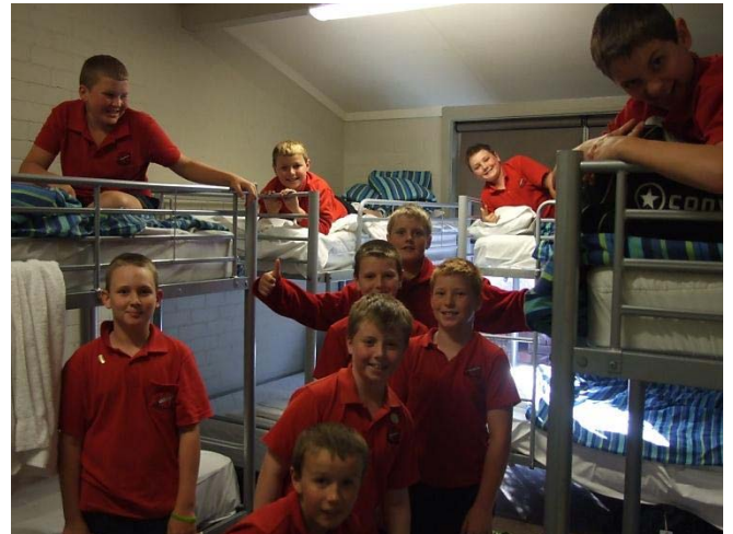
The Boys Dorm!