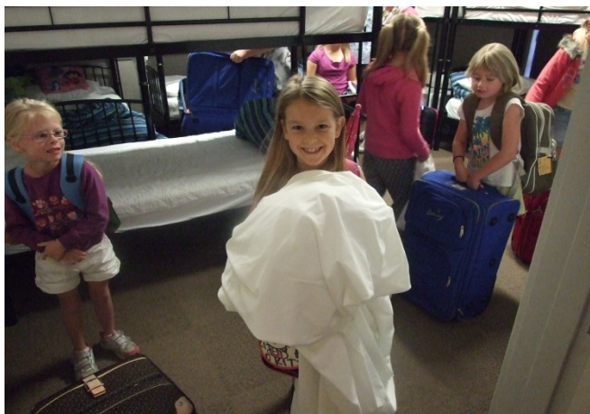
We even had to make our own beds and do the laundry!