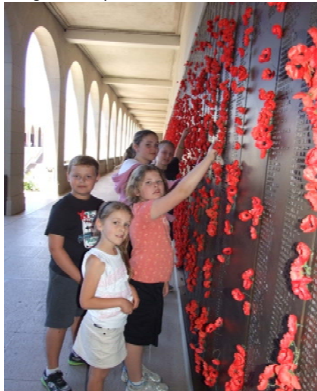
At the wall of remembrance – Australian War Memorial