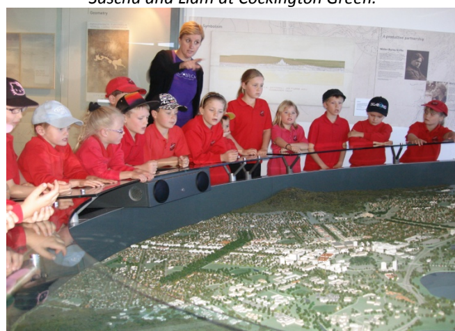
K-3 finding out about Canberra – National Exhibition Centre