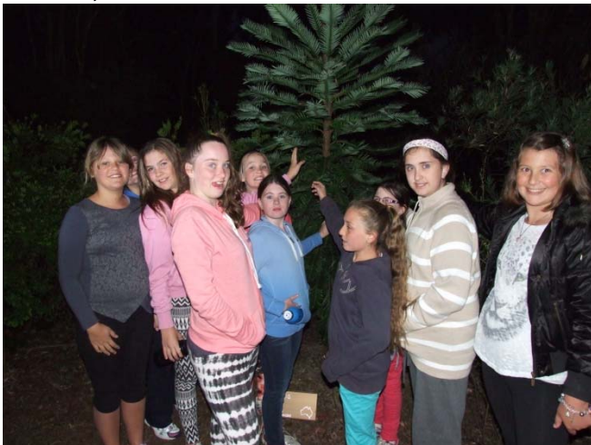
4/5/6 Girls exploring the Wollemi Pine in the Botanical Gardens Night Tour.

What a terrific whole school excursion we had last week to Canberra! 41 excited students, four enthusiastic parents/grandparents and four dedicated staff spent a jam-packed three days and two nights in our nations' Capital! We were blessed with wonderful weather and all of our activities were very educational and of course LOADS of FUN! Pictured below are some of the great photos taken by some of the students, teachers and Garth Collins.