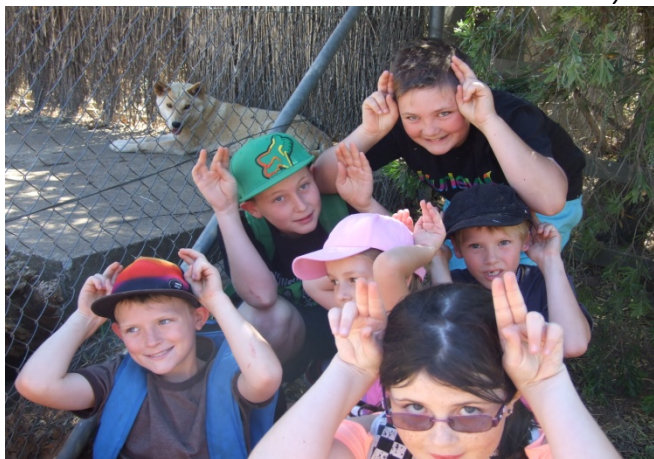
Dingoes everywhere at the National Zoo!