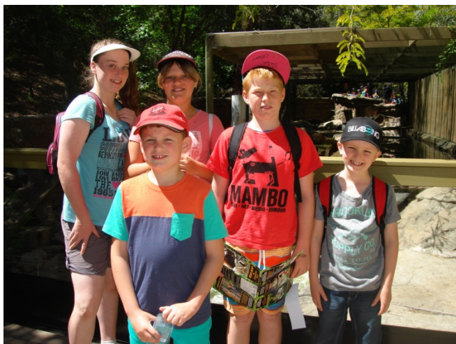
Having a great time at the Zoo!