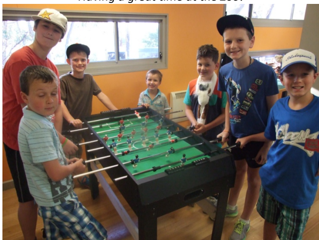
It was fun learning how to play foosball at the Lodge!

After such a terrific time in Canberra I would like to mention a few special "Thankyous".