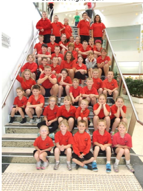
The whole school sitting on the 5c staircase at the Mint!