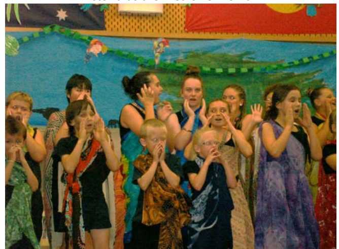
“You’re gonna hear me ROAR!!!!”