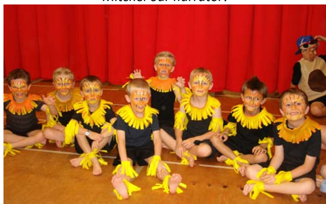
The Lions were ferocious (but also very cute!!)