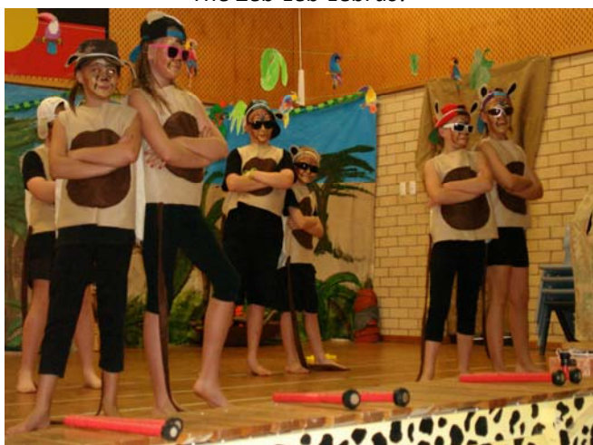
The Funky Monkeys were very groovy!