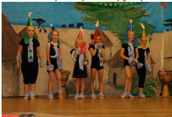
Ellie Elephant performed by Year 1!