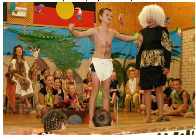
Tarzan and a very glamorous Jane!