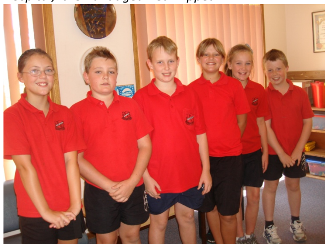
HPS School Council members for Term One.

The Student Council have already had their first meeting and their main event for Term 1 will be organising the Swimathon. To kick off their fund-raising they are having a special Canteen Day next THURSDAY. Families are asked to send in a plate of something yummy to eat (e.g cupcakes, watermelon, fruit kebabs, fairy bread, biscuits, etc). This will then be sold at the Canteen – most items go for 20c each – with funds raised going to Westmead Childrens' Hospital, the Bandaged Bear Appeal.