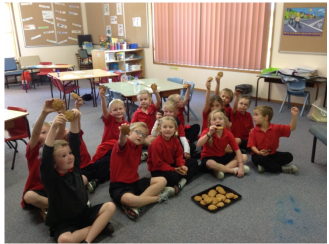
Hands up who likes Anzac biscuits?