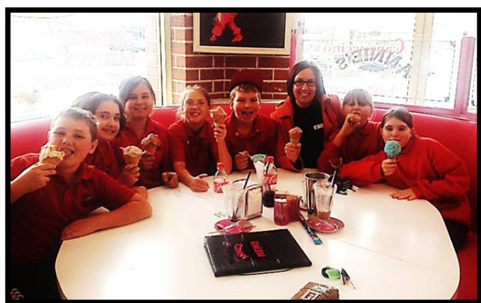
YUMMMM...Annie's Ice Cream is the best!