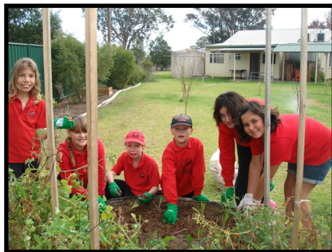
Here is the 'green thumbed' Vegetable Garden group tending to the newly planted winter vegetable plants - silverbeet, lettuce, the herb coriander and one shallot.