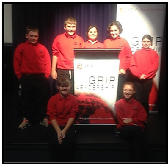
Just before the Conference started....