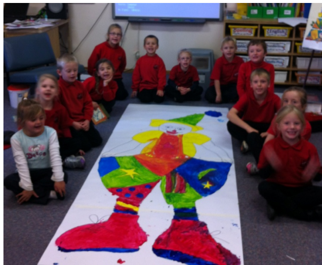
"Smarty Pants" - The finished product!

This week in Guided Reading we have started a new Big Book titled 'Smarty Pants', which was the inspiration this week for our Visual arts theme. We created a giant clown and used primary coloured paints to transform him into a brightly coloured character.