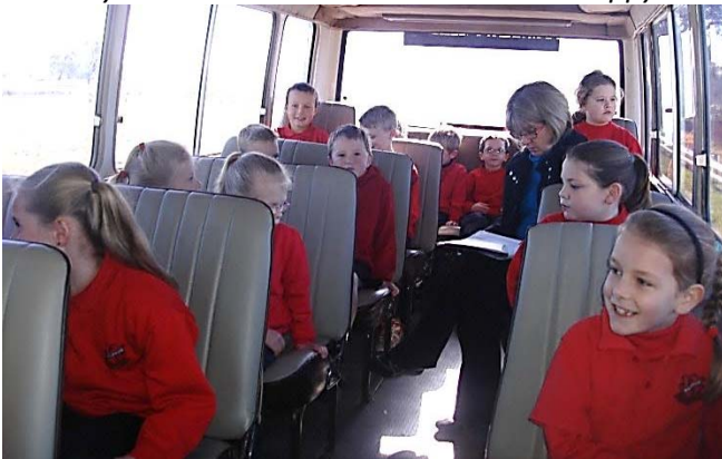
Heading in to PCYC on the bus was an adventure for K/1/2!