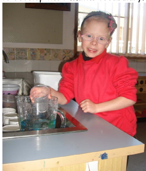
Bella explores the concepts of full, half-full and empty using coloured water.

The K/1 Class has had another wonderful week! During Maths lessons this week we focused on Volume and Capacity, with lots of hands-on experimentation and exploring! This really helps children to learn the 'language' of Maths through play; including full, empty, measure, pour, half-full and so on. The children really love to get involved and including your child in these sorts of activities at home (for example, when you are cooking dinner) really assists them to develop their Maths vocabulary.