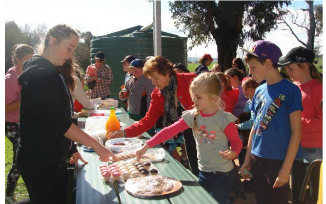
The Student Council ran a super canteen last week!

have a look at their children's work books. Thank you to all those families who attended.