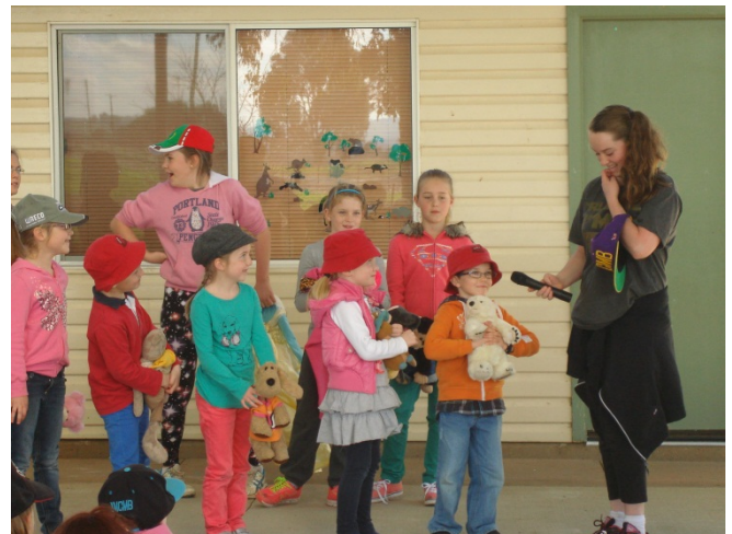
The Furry Friends Parade was very cute!