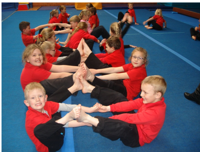
K/1/2 practising their flexibility at Gym last week.