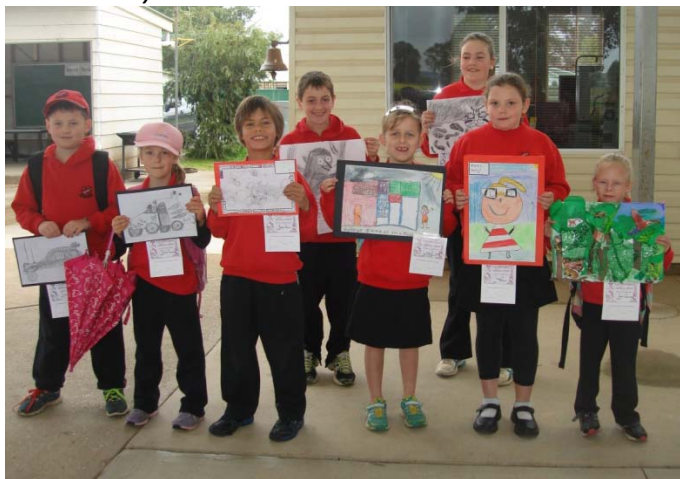
Cowra Show Art Competition Prize winners with their entries!