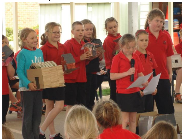
Year 2/3/4 presented their "Buildings" they created in Science at our Term 3 School Assembly

Congratulations to all of these students