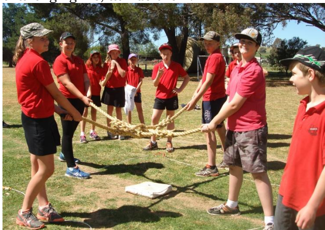
Year 5/6 playing the 4-Way Tug-of-War!

On the Oval the students and the Staff are enjoying learning new Circus Skills. These skills improve concentration, flexibility, fitness, stamina and strength. The 4 Way Tug-of-War has proven to be exceptionally popular and a real test of strength and fitness skills, as well as lots of fun and laughs. The children particularly enjoy challenging me, as I do them.