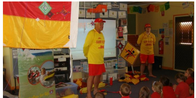
All students K-6 enjoyed participating in the Bush to Beach talk.