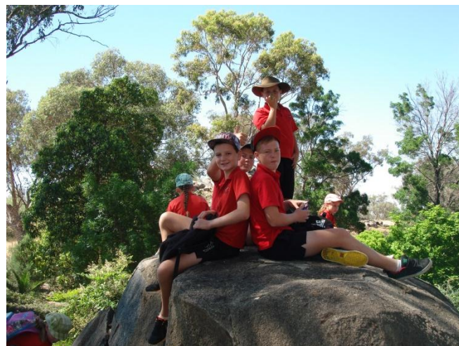
What a great place for "Fruit Break"!