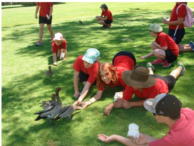
The ducks were so tame...they even ate out of our hands!