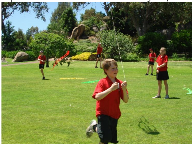
It was great fun flying the kites.