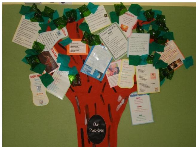
Our 5/6 Class "Poet-tree"!

Our room is really starting to come alive with lots of student artwork and writing on display. We completed our Poetry Unit last week by selecting our favourite poem, we had written and publishing this on our "Poet-tree". It looks terrific!