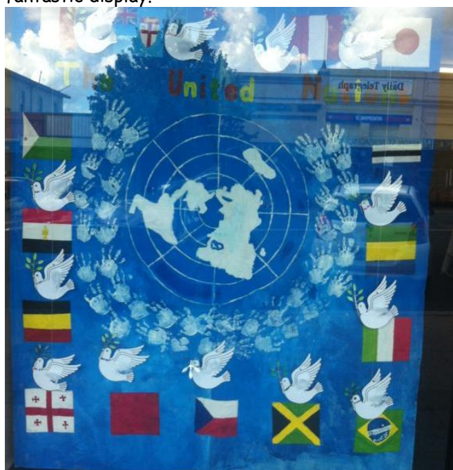
Our school's United Nations window display at "Browse Awhile"!!

This weekend will see Cowra host the Festival of International Understanding. A street parade will take place on Saturday morning. Please make sure you look in "Browse Awhile's" shop window to see our fantastic display.