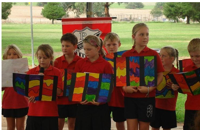
Year 2/3/4 showed us some stunning artworks in cool and warm colours at the Assembly.