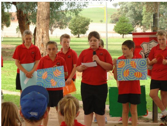
Year 5/6 presented a variety of work they have completed over the course of the Term – Artworks, Poetry and Genius Hour.