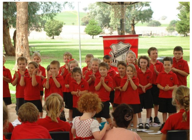
The K/1 Class entertained the crowd with their wonderful rendition of "BINGO" at last week's assembly.

Thank you to the large number of parents and family members who turned up to watch our End of Term Assembly this afternoon! The students enjoy sharing what they do at school with you, and your attendance is appreciated.