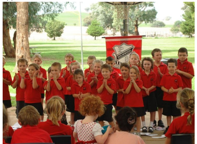
The K/1 Class entertained the crowd with their wonderful rendition of "BINGO" at last week's Assembly.

Thank you to the large number of parents and family members who turned up to watch our end of term Assembly last week! The students enjoy sharing what they do at school with you, and your attendance is appreciated.