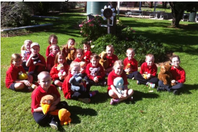
K/1 welcomed "Snow Drop" (named by K/1 students) to our classroom with our Teddy Friends.

This term we have a Teddy Bears Picnic Theme and we have a visitor in our class. Her name is 'Snow Drop' the Care Bear. Snow Drop will be our class Mascot and she will inspire us in our story writing. We are excited to have Snow Drop, however all students are asked to bring in a teddy bear that can play with Snow Drop and become a member of our class for the term. We will be reading to our bears, and writing stories about them so it's important that your child can bring in a teddy that can stay at school for the term. If your child has any books on teddies or bears that they would like to share with their friends it would be appreciated if they could bring them in for news.