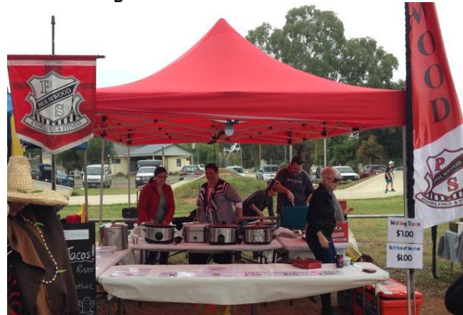
The hard-working P&C setting up for the Night Markets.