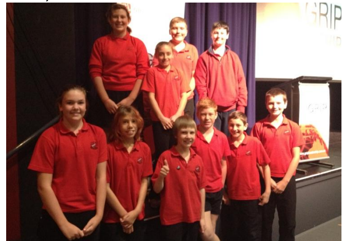
Year 6 pictured at the Grip Leadership Conference.