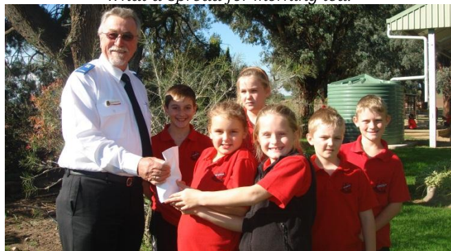
Student Council members presenting the money raised for the Red Shield Appeal.

Winter Warmth Appeal has been launched with the kind donation of two bags of scarves and a big bag of colourful beanies. We are extending the appeal this year to include warm, woolly socks too. The Student Council would greatly appreciate your support in the donation of