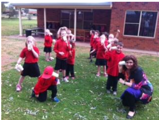
Discovering how the old telephone system worked was great fun!