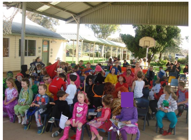
It was great to see so many parents attend Book Fair!

Below is a small selection of photos taken during Book Fair.