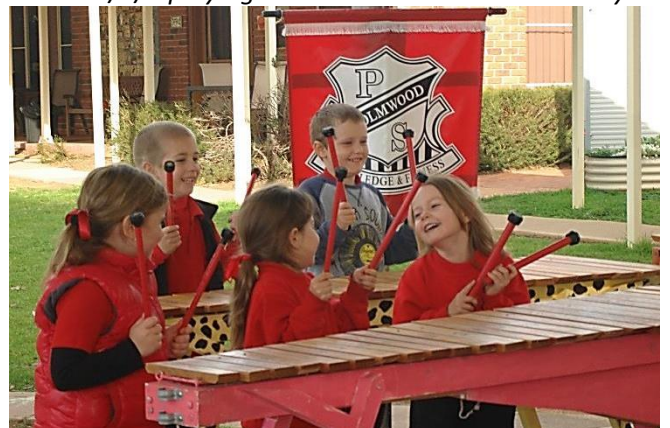
K/1 had great fun playing "Click Sticks" on the marimbas!