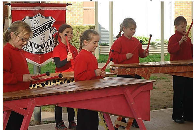
Year 2/3/4 playing the Marimbas at our Assembly.