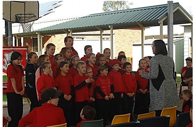
The choir performed an encore performance of "Three Little Birds" and "The Cup Song" which they sang at the Cowra Eisteddfod earlier in the year.

students on their wonderful performances and excellent behaviour.