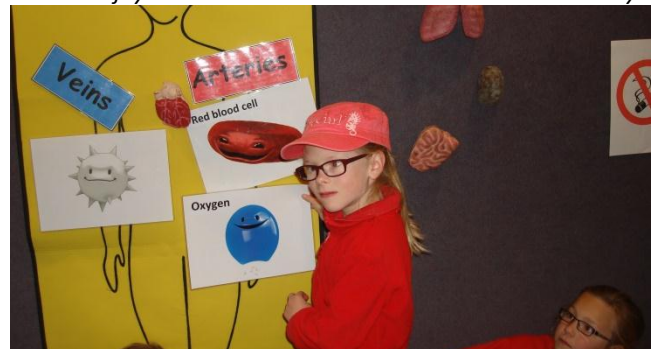
Bella discovering the different systems in the body.