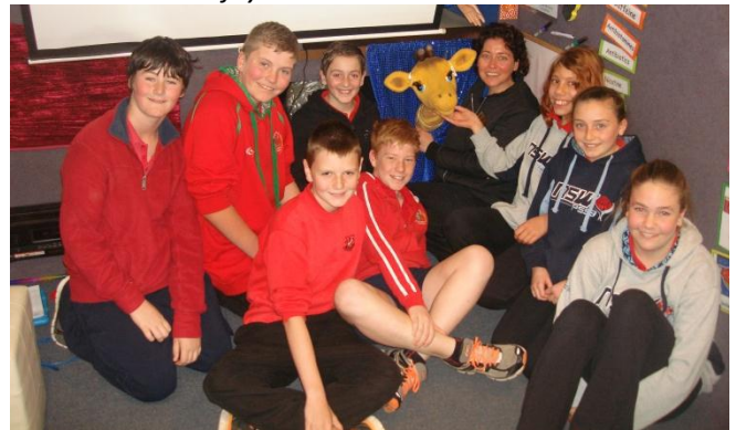
Year 6 enjoyed their last ever visit with Harold on Tuesday!

All students from K-6 enjoyed Tuesdays' visit with Healthy Harold and the Life Education Van. Year 5 and 6 learnt about safe and unsafe drugs, making decisions and cyber safety. Year 2/3/4 had a great time learning about the different systems in the body and K/1 had a ball going on a Mystery Tour with Harold, where they travelled all around the body! The teachers also enjoyed their visit to the van!