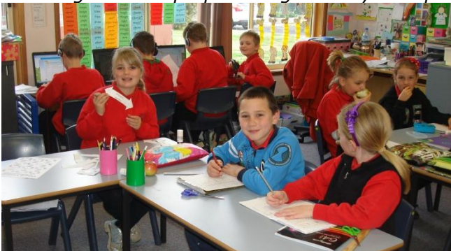
A busy 2/3/4 Class during Literacy Groups!

Our class had a great discussion about Internet Safety. This is an important and relevant topic for all age groups and families to consider. All classes shall be discussing the dangers on being online and talking about some rules to be used when "on the 'Net".