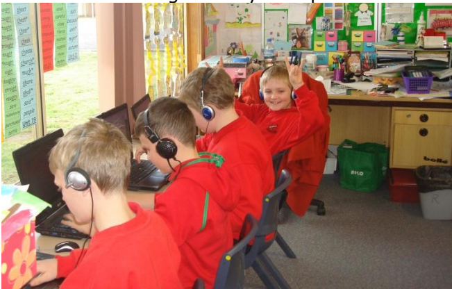
Learning on the laptops during Literacy Groups.

We have many moments during our week like those ~ for example Year 2, with the help of some great Year 4 tutors have learnt about vertical setting out of algorithms; Year 3 and 4 are perfecting their regrouping skills in addition or becoming more independent when working on activities during Literacy Groups.