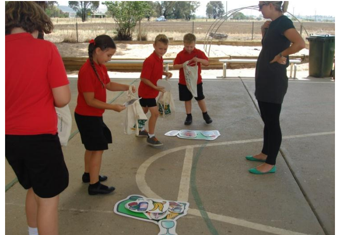
Year 2/3 playing the Recycling Relay!

All the students were beautifully behaved and enjoyed their one hour workshop!