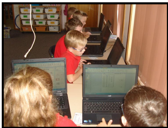
Having fun on the computers in the 2/3 room!

During Spelling this week, we had a bunch of super excited children very eager and keen to make their very own 'word cloud' on the computers using their weekly spelling words. Everyone was engaged and we can't wait to make one again!