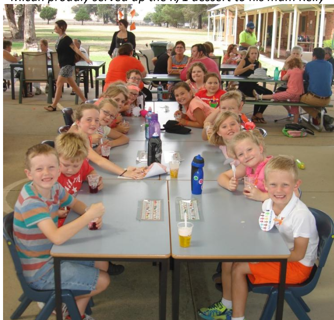
The 2/3 Class enjoying Harmony Day!