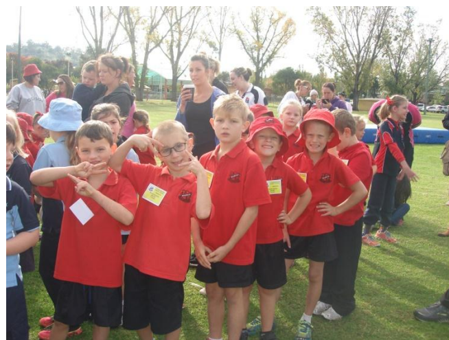
Holmwood boys ready for their 100m races!