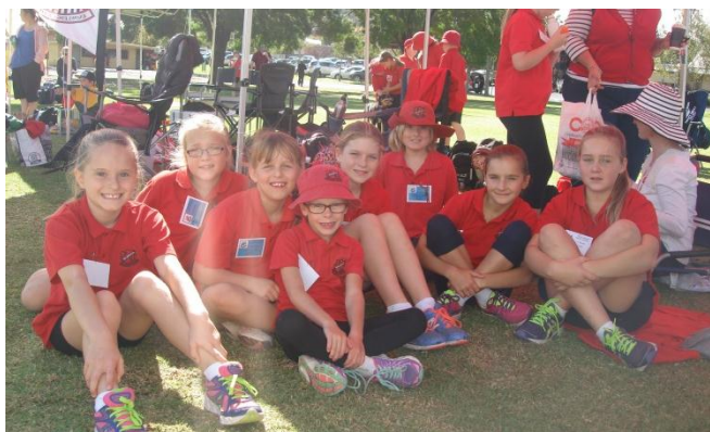
Rest time in the Holmwood tent!