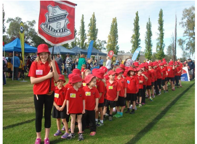
Holmwood PS ready for the march past!