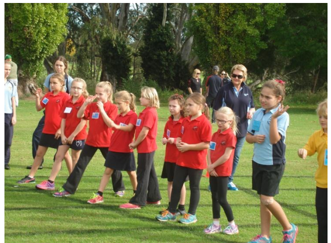
Junior Girls lining up for the 800 metres race!