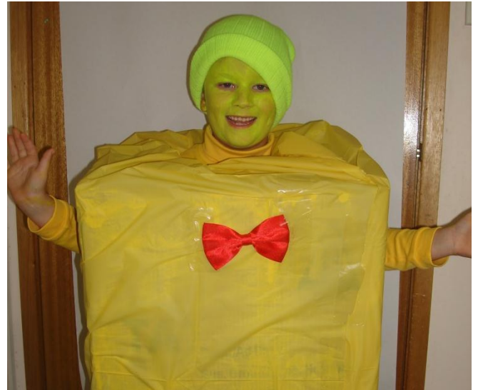
SpongeBob Squarepants (otherwise known as Caleb!) looked fantastic!