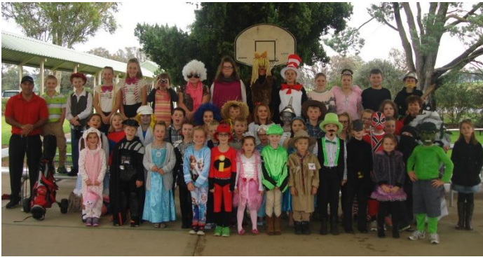
The effort that everyone went to in creating their costumes was AMAZING!