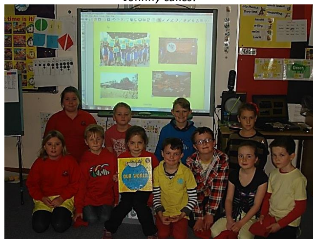
The "Emus" group learned about the Bardi Jaawi Community School in Western Australia.