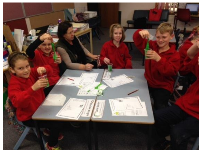
Stage 2 students making "Slime" on Wednesday afternoon

In Kitchen Chemistry in the Stage 2 class students learnt about polymers and the changing state of liquids to semi solids by making Slime. Students predicted and recorded the reactions of the materials when mixed together to form a chemical reaction.