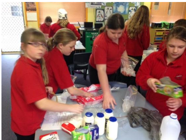
Stage 3 students had great fun making ice cream in Science this week.

Have a good weekend ready for a busy Education Week next week.